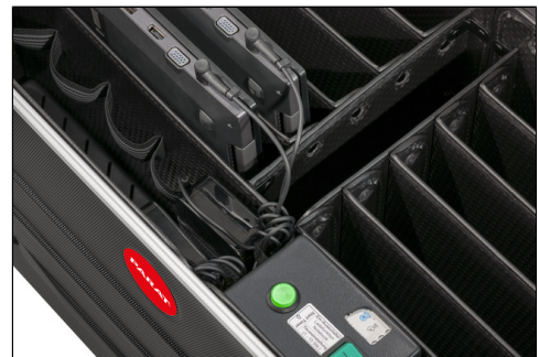
- Charge (Switch On/Off)