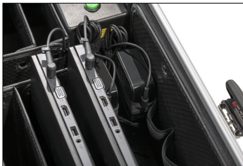
- 10x storage compartment for laptops up to 15.6"