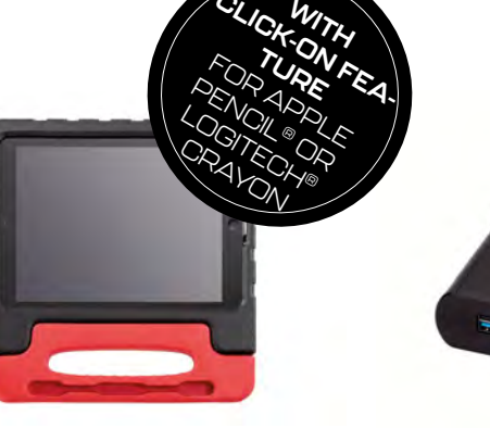
EDUCOVER®+ protective case incl. stylus holder

zip fastener with double zipper (lockable) I business card pocket (outside) I compartment for accessories inside I shoulder&carrying strap I10 padded compartments for tablets up to 12.9" I reinforced bottom and side panels part no. 5990861991