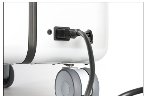
- central power supply with protective cap