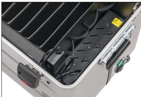
- storage compartment for power units