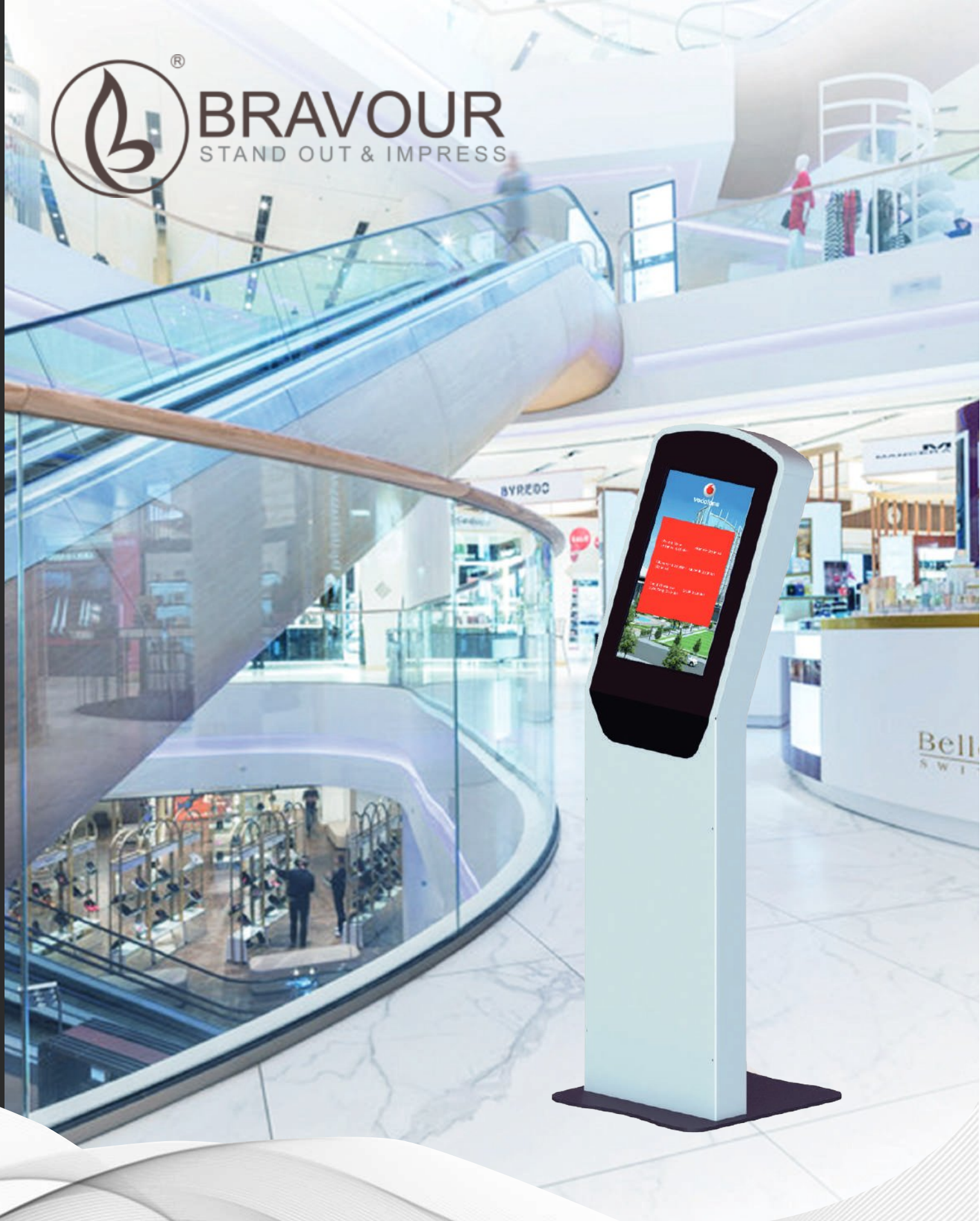
VALLETTA - Interactive Touch Screen Kiosk